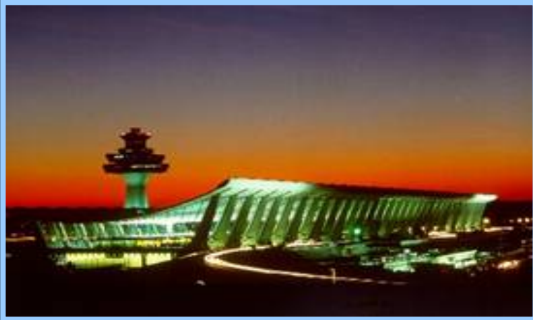
Dulles & Reagan International Airport