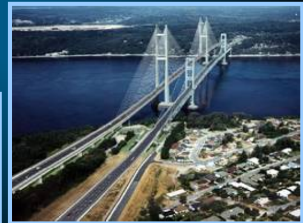
Suspension Bridge Tacoma, WA