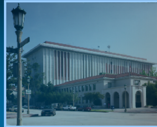
L.A. County Earthquake Recovery