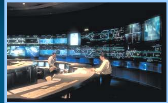
Boston MBTA Control Center