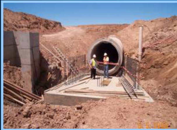
Imperial Irrigation District