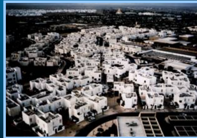
City of Yanbu, Saudi Arabia