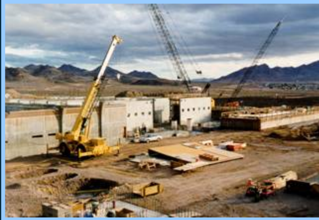
Southern Nevada Water Authority