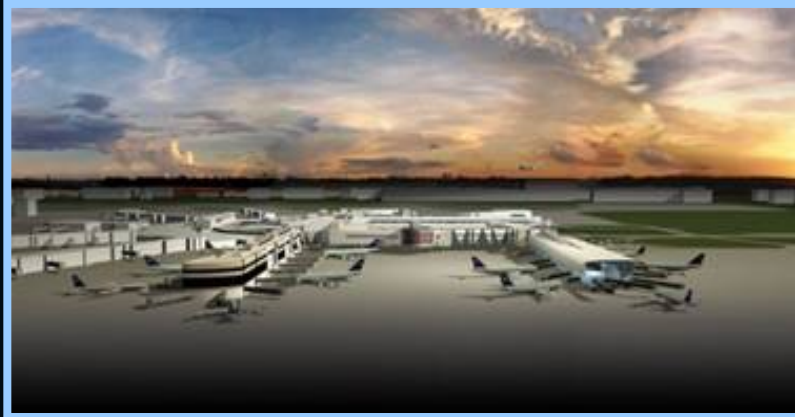
Miami Airport Rendering